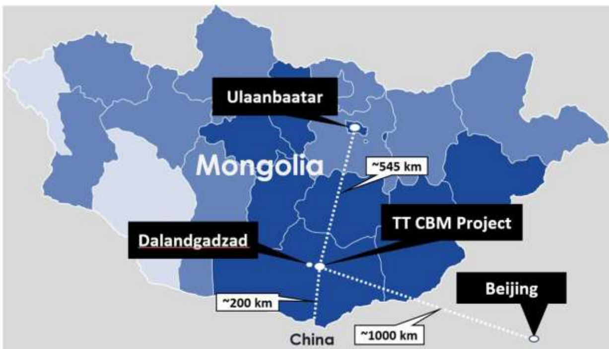
Figure 3: Map showing the location of the Projects within Mongolia

The PSA has been awarded to Erdenes Methane LLC. Under the joint venture agreement between Jade Methane LLC and Erdenes Methane LLC the PSA must be transferred to MGR. This process is in train and is subject to Government approval.