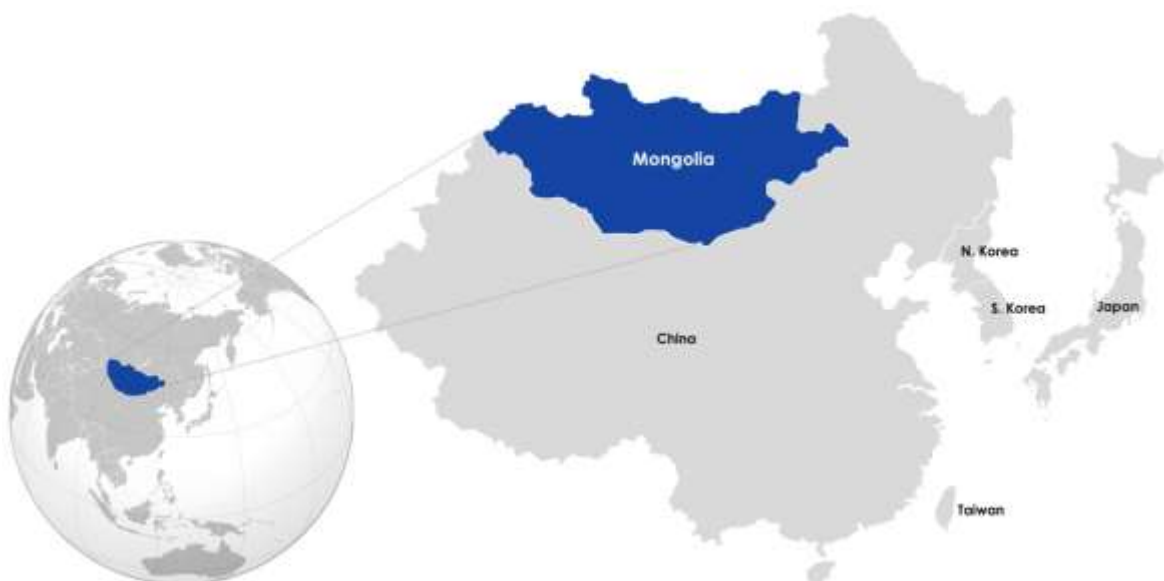
Figure 2: Mongolia location map

Jade is focussed on the coal seam gas (CSG) potential of Mongolia. Mongolia is located between Russia to the north and Peoples Republic of China to the south. Jade’s current activities are located in the South Gobi region approximately 200 km from the border with China.